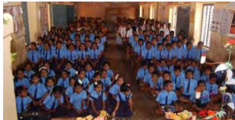
Students gather to celebrate Kanchana Foundation's first step