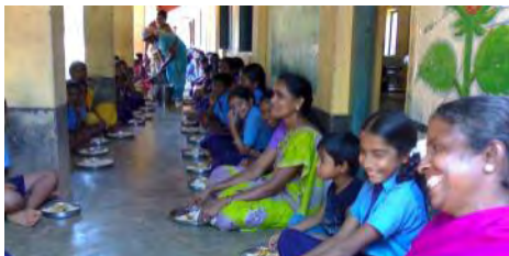
Enjoying a day's meal, as a part of Women's day celebration