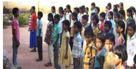
The morning assembly