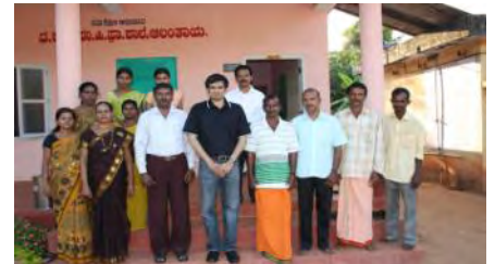
With school staff and village administration