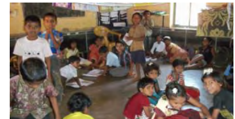
Students busy with various activities