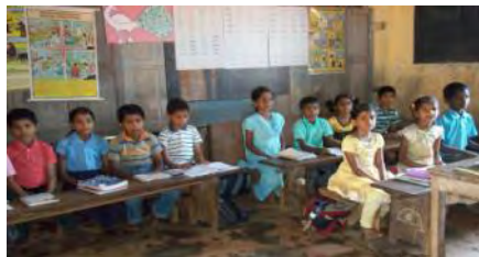
With a passion to learn