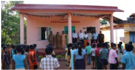
The day it all began– Kanchana Foundation's first step