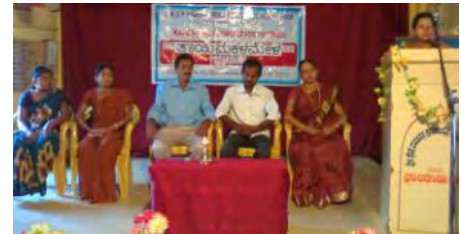
Women's day celebrations at Alanthaya school