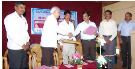
Memorandum of Understanding was signed