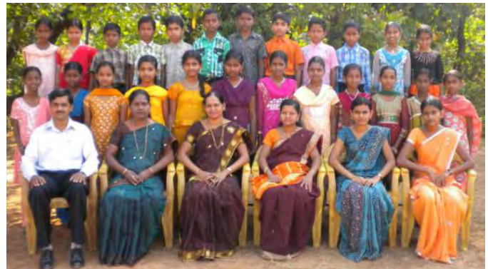
The teachers and students of government higher primary school, Alanthaya

The Foundation is currently in a strategic partnership with this school.