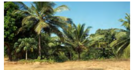
A view around the school