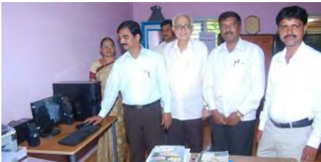
The first computer– A generous contribution to the school